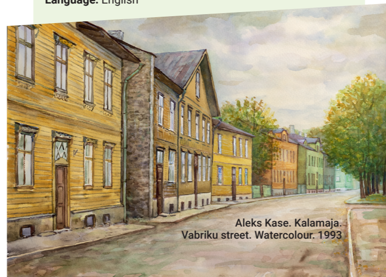
Aleks Kase. Kalamaja. Vabriku street. Watercolour. 1993

Duration: 60 minutes Language: English, Russian